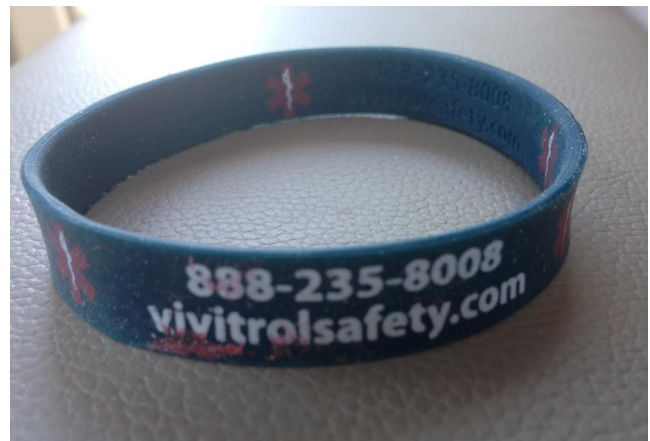
Figure 1. Inmate Vivitrol ID bracelet given to MAT participants in Massachusetts

The weekly groups are run by Spectrum, which also provides the RSNs.